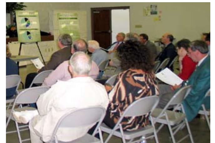
Meeting participants listen to a presentation