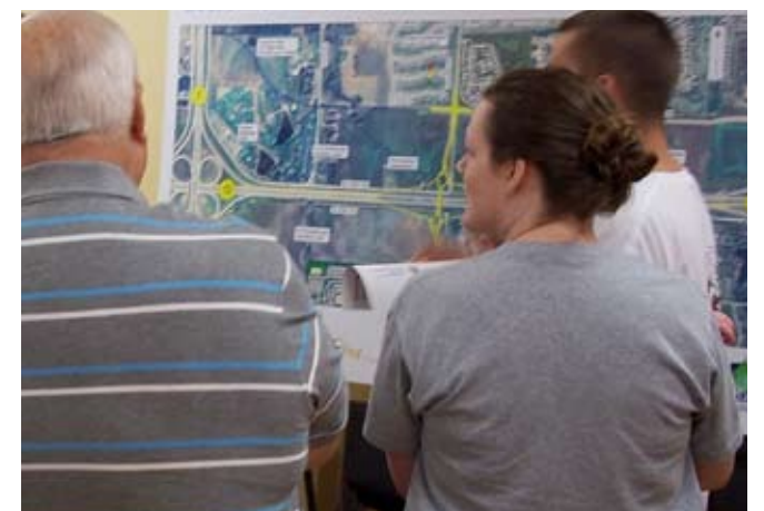
Meeting participants review exhibits