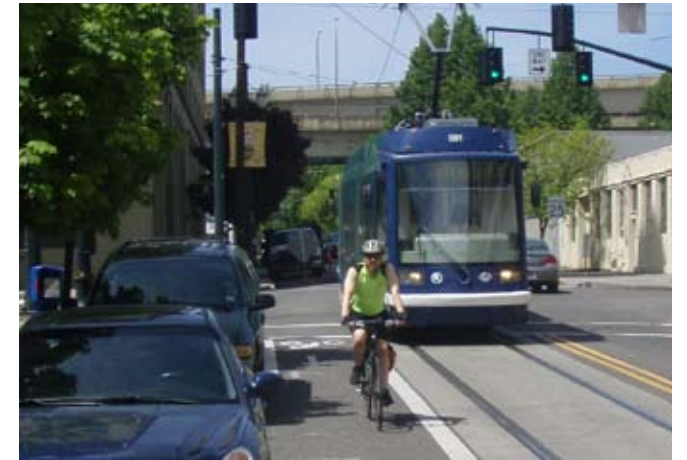
Example of modern streetcar