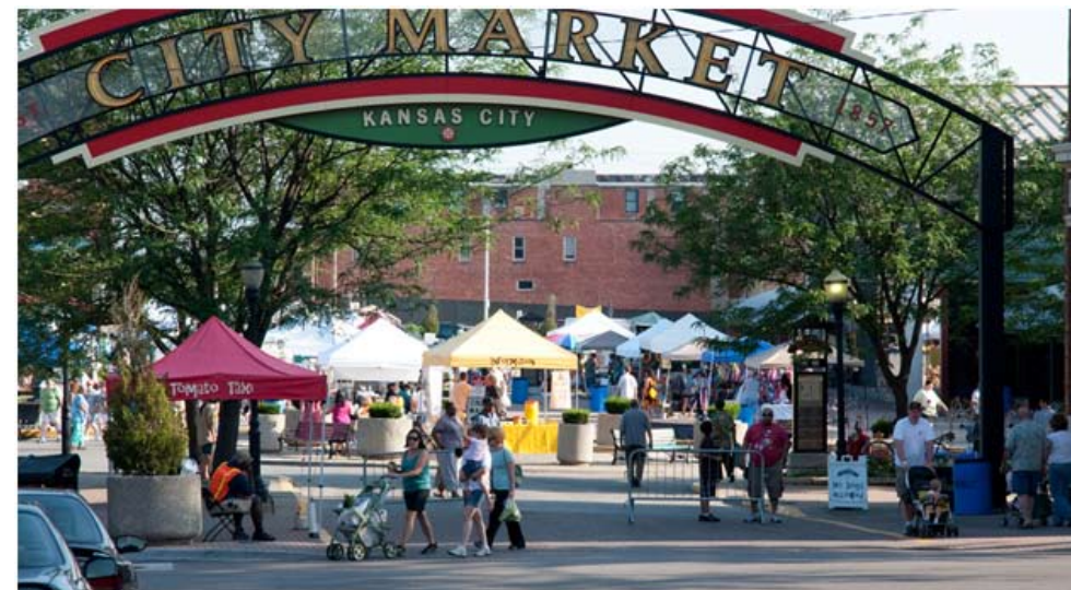
The new starter line will connect downtown activity centers such as the River Market.

The Partnership Team and consultants will begin assessing the multiple alternatives on display today against a number of factors, including community concerns, potential ridership, right-of-way issues, economic development potential, operating and construction costs, plus traffic, land-use, environmental, and historic impacts. The assessment will result in a smaller number of alternatives that will be presented at the second open house in September. Ultimately, one LPA for a transit connection between River Market and Union Station/Crown Center will be selected with a corresponding plan to fund it. The LPA is Federal Transit Administration requirement and is necessary in order to obtain funding for the starter line.